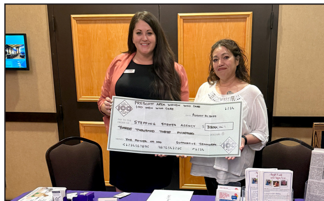
Stepping Stones associates presented at and received a $3,300 donation from the event.

Stepping Stones was honored to be a part of the 100 Men Who Care and Prescott Area Women Who Care event in August. We were able to share about our 45 years of safety, healing, and hope for local families work are working so hard to live free from abuse!