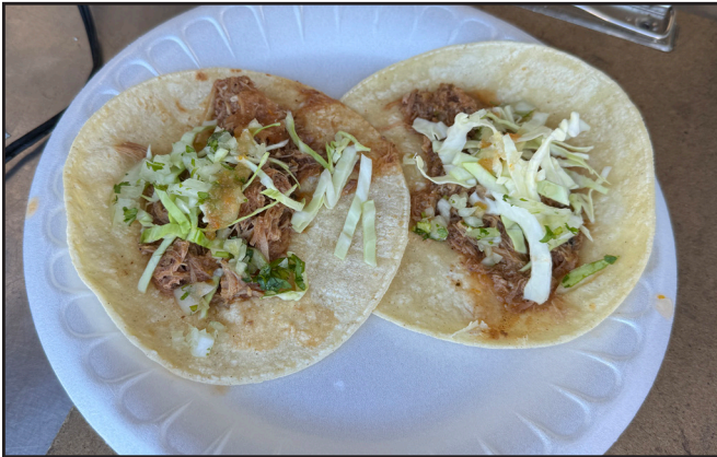
Ana's Breakfast 2Go is open Tuesday - Saturday from 9 am - 4 pm onsite at Stepping Stones Thrift Store - 2651 N. Industrial Way in PV.