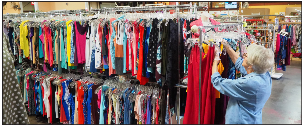
Volunteer hanging clothing on racks at the thrift store in Prescott Valley.

STEPPING STONES THRIFT STORE: 928-499-3260 DONATION PICK-UP: 928-759-0225