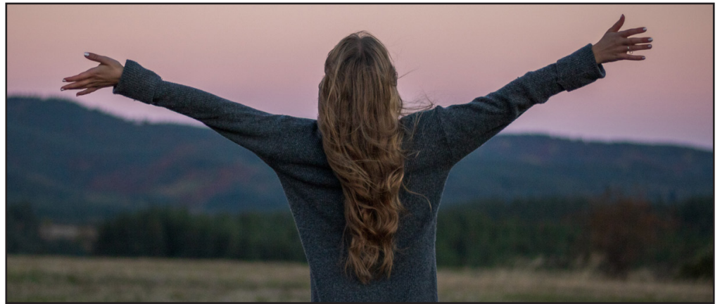
Families find freedom from abuse and support day and night through Stepping Stones' 24/7/365 Helpline: 928-445-4673.