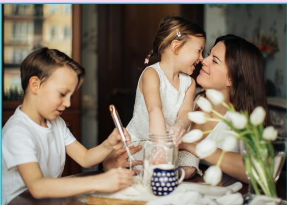
Families find support day and night through Stepping Stones' 24/7/365 Helpline: 928-445-4673

At Stepping Stones, supportive fellowship, connections to resources, and supportive one-on-one support all play a role in helping adults find freedom from abuse. Adults complete an anonymous survey upon exit to provide feedback. From October 1 through December 21, 2023, they reported: