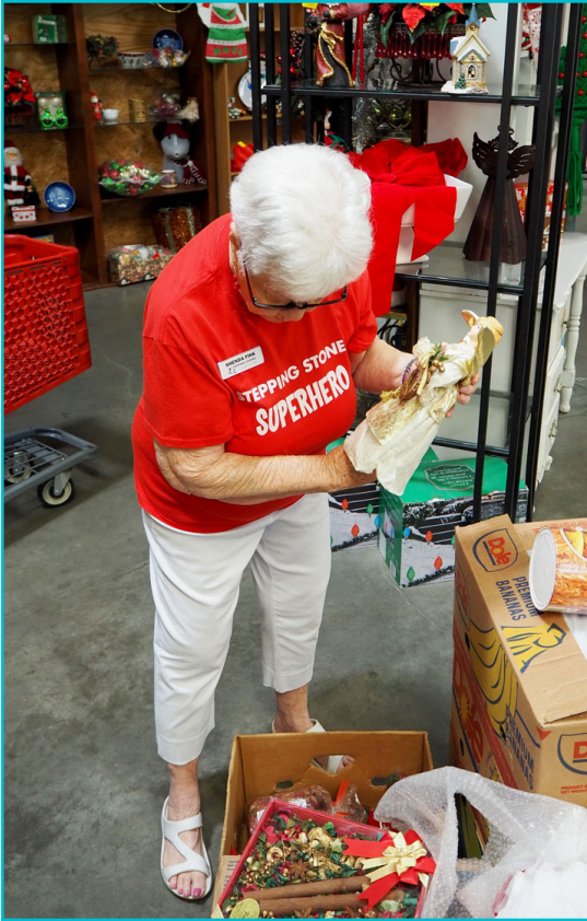
Volunteers help put items out on the shelves and racks for customers to shop - from seasonal holiday to clothing to books and more!

packets and filing paperwork. We are so grateful for the time and talents our volunteers bring to our organization. Check out a few notes from them about why they love being here!