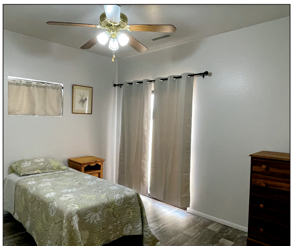
Stepping Stones transitional housing offers families safe, affordable places to live while they continue to do the hard work to live free from abuse.

When you call the 24/7/365 Helpline, you'll get an advocate right away - no answering machines or waiting for a call back. We are ALWAYS available - day or night.