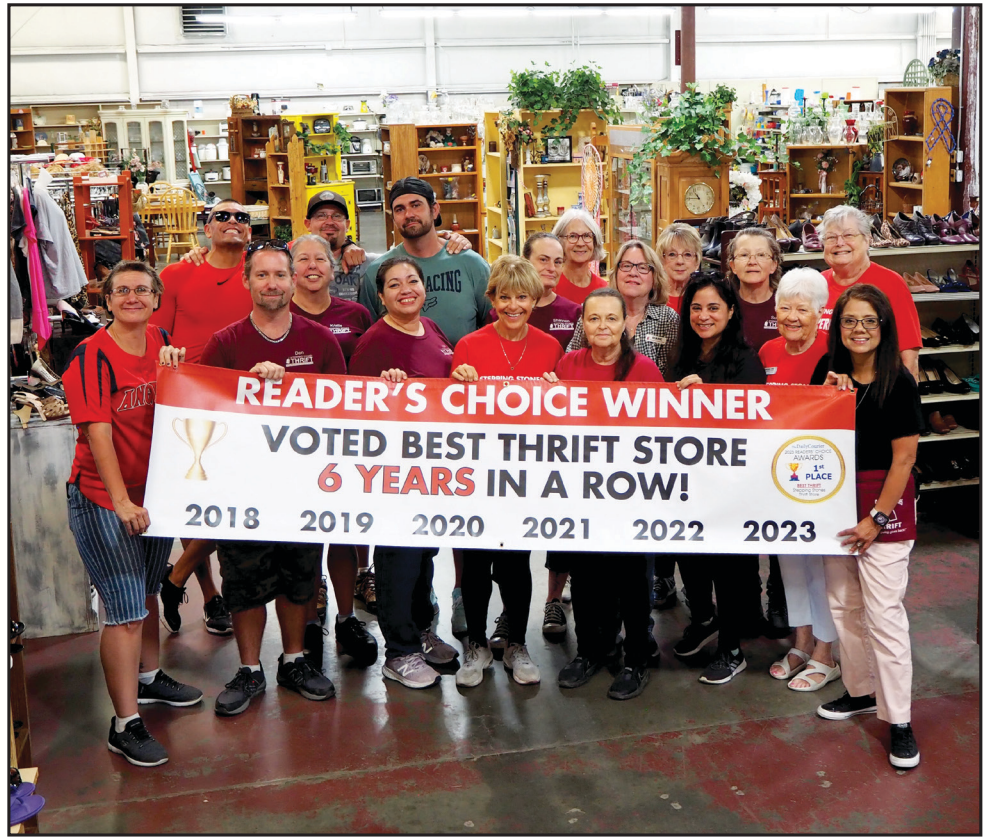
Stepping Stones Thrift Store features gently used items donated by the community from clothing to home goods to furniture and more. Our associates accept donations, sort and price items, and fill the shelves for you to shop. Thank you for supporting families with us!

Thank you for shopping, donating, and supporting Stepping Stones Thrift Store for 25 years! It's because of you that we are able to provide our around-the-clock advocacy services to local families who are looking for freedom from domestic violence and other forms of victimization. Thank you for making a difference in our community!