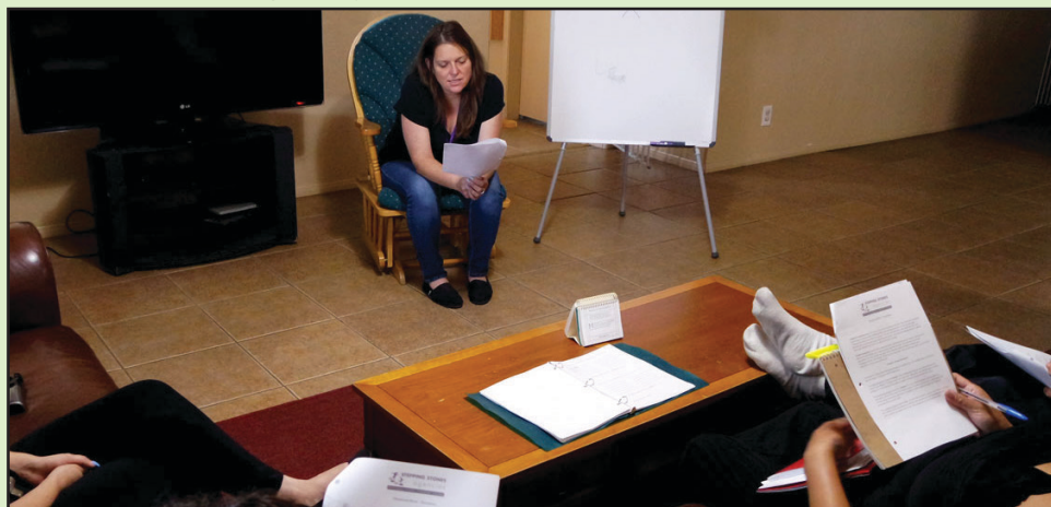
Educational support groups happen daily in our 24/7/365 advocacy services.

Second chances are all around us - there for the taking. Reaching for our own potential simply means taking the opportunity to grasp for it, no matter what age or stage of life we're in. What are you waiting for...an invitation? Consider this moment your call to move forward, make the decision, take a risk and embrace a second chance. We can't wait to see what you do!