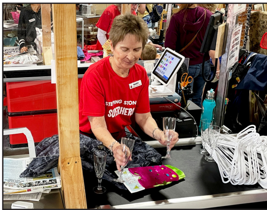
Sorting and organizing treasures.