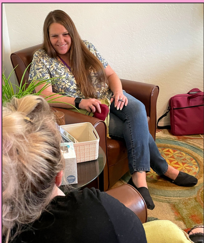
Advocates provide support for families in our emergency shelter, as well as those who live in transition housing.

Transitional housing is an option for adults and their children when they complete their time in our emergency shelter services. When someone moves into our transition housing, they can live there for up to two years, providing more time for them to continue to work with our advocates and get back on their feet.