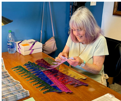
Administrative office support.