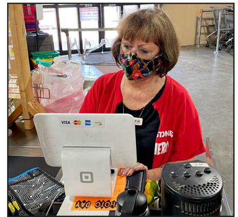
Cashiering and customer service.