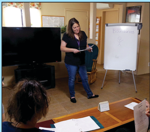
Advocates available 24/7/365. Call our Helpline at 928-445-HOPE (445-4673).

Families are able to start the hard work of finding freedom from abuse by making a phone call and connecting with our advocates. Once they are connected, they can begin their work in a safe place. Adults in our programs take an anonymous survey upon exit to provide feedback. From January 1 - September 30, 2021, those who participated shared: