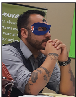
by Jesus Gutierrez

86 individuals are currently volunteering with Stepping Stones Agencies. Each one of these phenomenal volunteers have stepped up to support