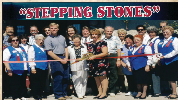
Stepping Stones' first thrift store grand opening.

ADVOCATES AVAILABLE ON OUR 24/7/365 HELPLINE 928.445.4673