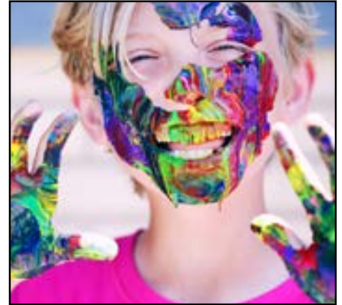
Families independent lives & reality able to find hope, happiness, and safety.

more than 830 bed nights - that's a 92% occupancy rate. But it's not just a safe place to sleep; advocates provide hours of support for each adult and child living in shelter. Whether they are setting goals and creating a safe, stable environment to attending educational support groups, adults and children receiving advocacy services are committed to working toward happier and healthier futures.