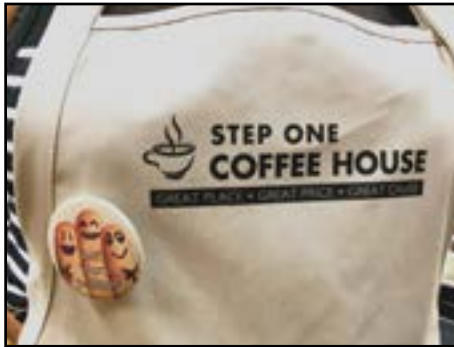
Check out our HAPPINESS buttons at our social enterprise locations! Tell us why you're HAPPY today!

for the moms and kids in our advocacy programs. Thank you for helping them find happiness again! If you or someone you know wants to find their happiness again, call our advocates 24/7/365: 928.445.HOPE (4673).